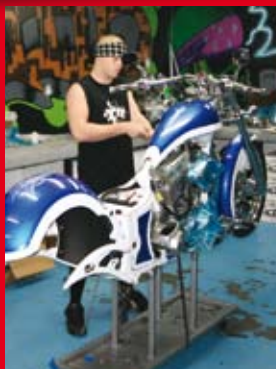
ABOVE: Wildcard assemble BBC bikes with meticulous care. BELOW: A showroom with plenty to show!

(Laughs) They're designed to be ridden hard, Doc, but yes, they develop about 80hp and around 100ftlb of