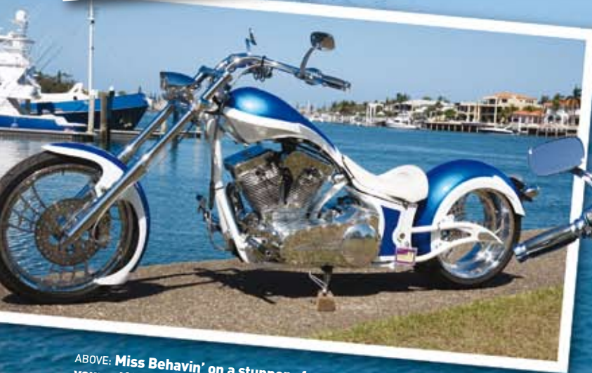
ABOVE: Miss Behavin' on a stunner of a day. Put yourself in the frame?