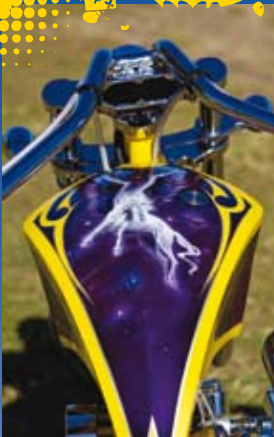
Pegasus rides again, this time on the fuel tank of a modern goddess...

Recently representatives from the Australian Government flew to America to inspect the BBC manufacturing process and wholeheartedly endorsed it from go to whoa. As far as I am aware, no one else in the Harley-Davidson aftermarket can say that about their plant.